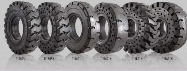
TJ1805 TJ1805H TJ1601 TJ1601H TJ1801H TJ1601H