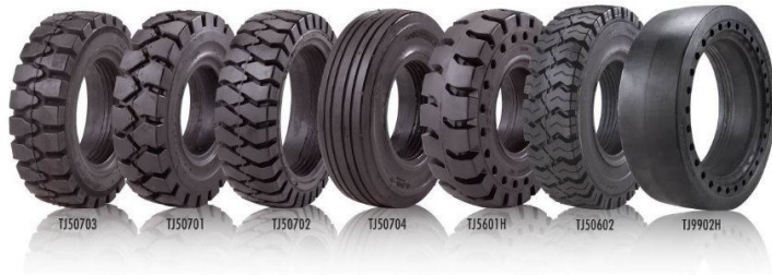
TJ50703 TJ50701 TJ50702 TJ50704 TJ5601H TJ50602 TJ9902H